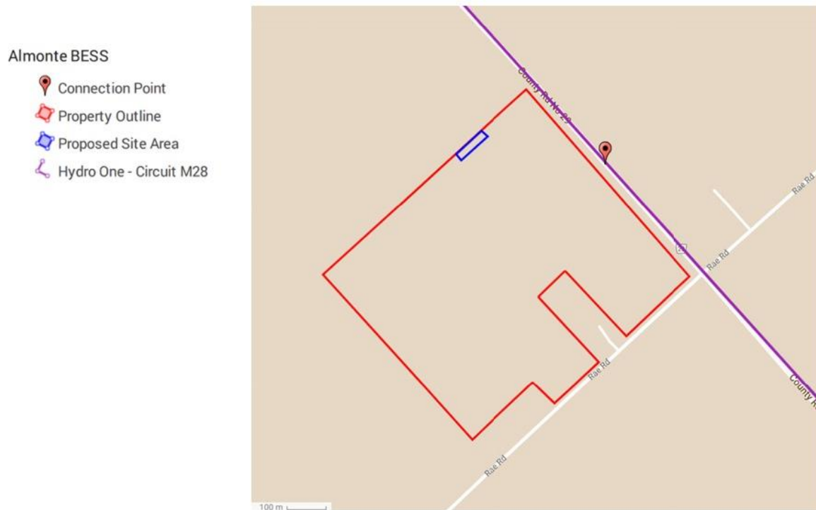
Figure 1: Almonte BESS scaled-site map

E-LT1 RFP rules and requirements ensure a fair and equitable procurement process, awarding contracts to only the best projects.